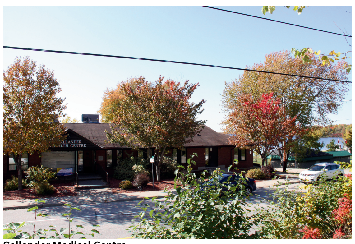
Callander Medical Centre